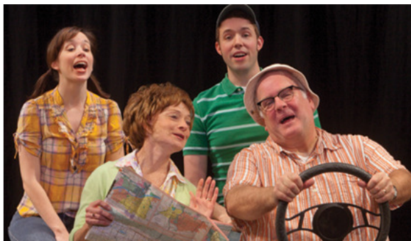
Fox Valley Repertory will present "Leaving Iowa" Jan. 29-March 13.